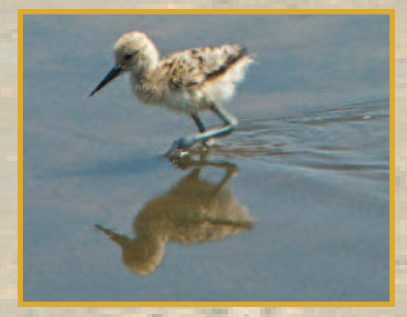
-Simon / Grade 5